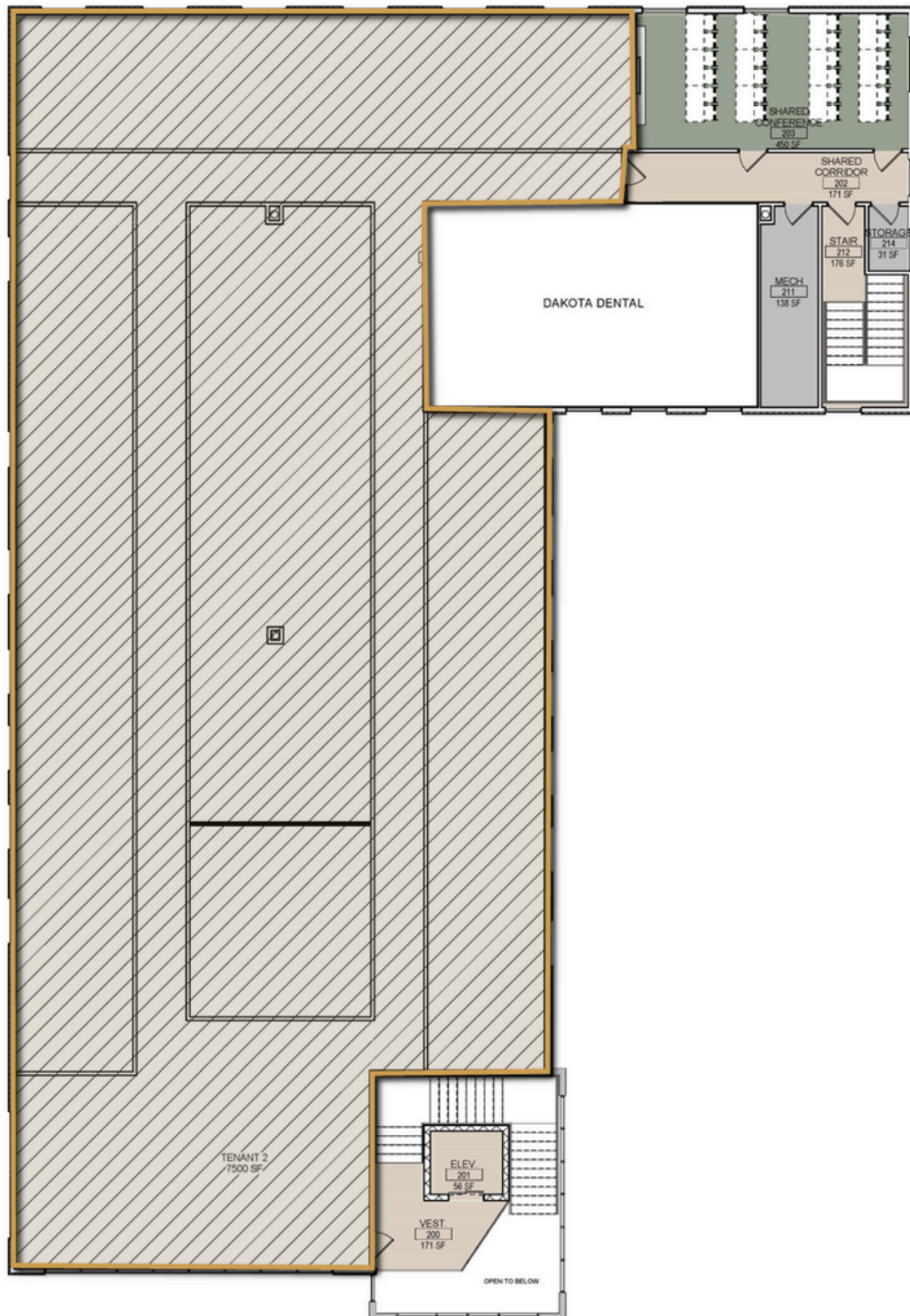
② SECOND FLOOR PLAN 1/8" = 1'-0"